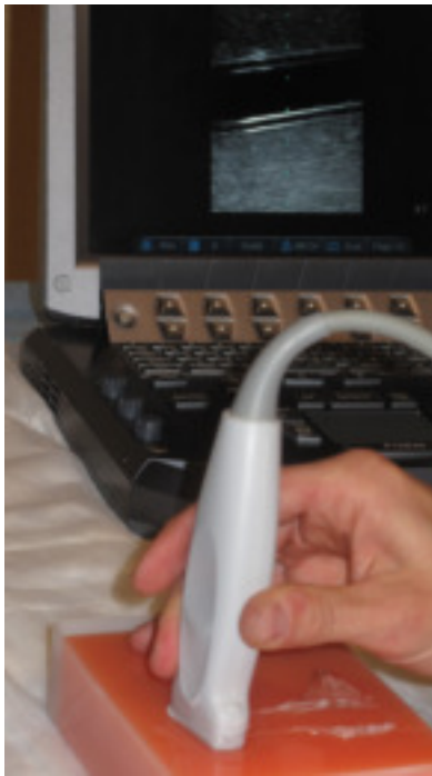
In Plane View of Vessel