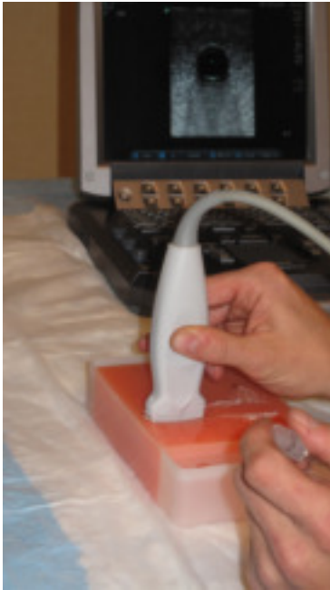
Out of Plane View of Vessel