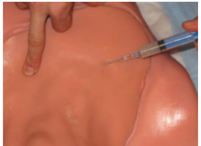
Step 4: Remove syringe, confirm nonpulsatile blood flow and advance guidewire through needle into vein