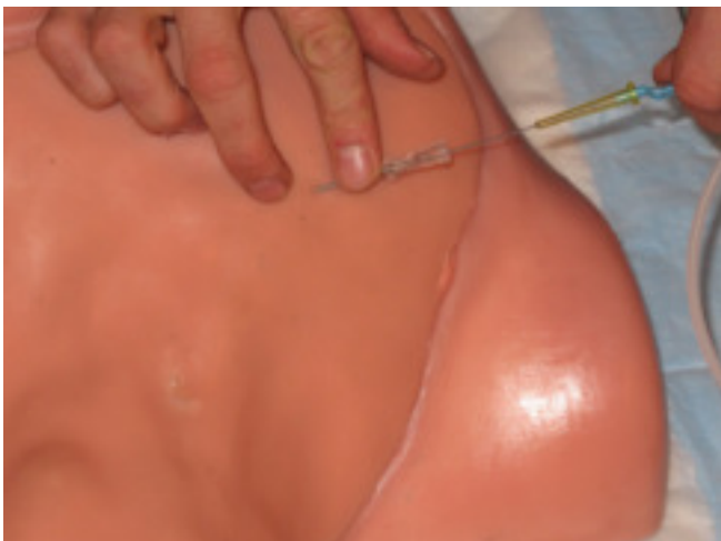
Step 5: Remove needle over guidewire