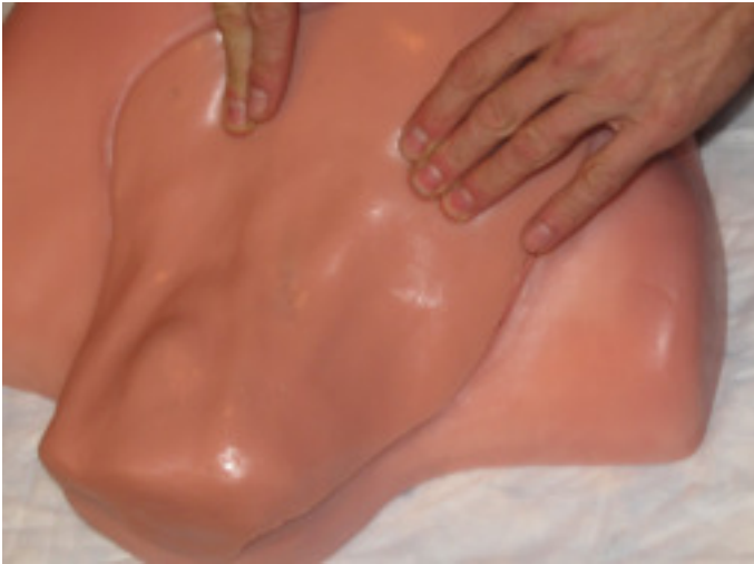
Step 1: Palpate landmarks: Jugular notch and curve of the clavicle