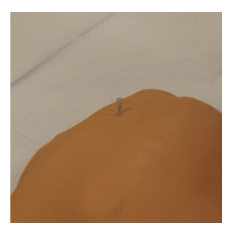
Step 4 : Leave catheter in place and prepare for tube thoracostomy