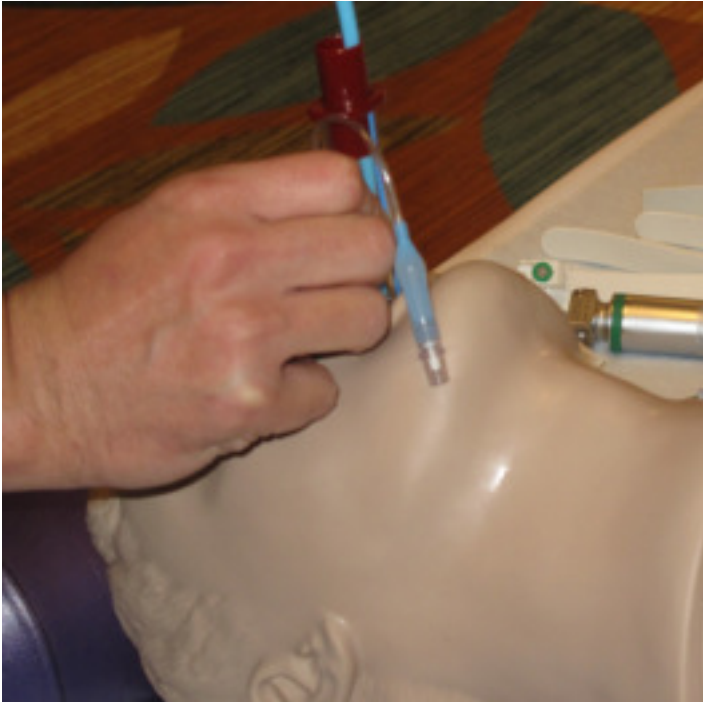
Step 1: Insert Bougie through gastric port of King Tube