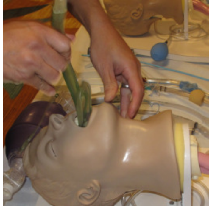
Step 2: Insert LMA along roof of mouth