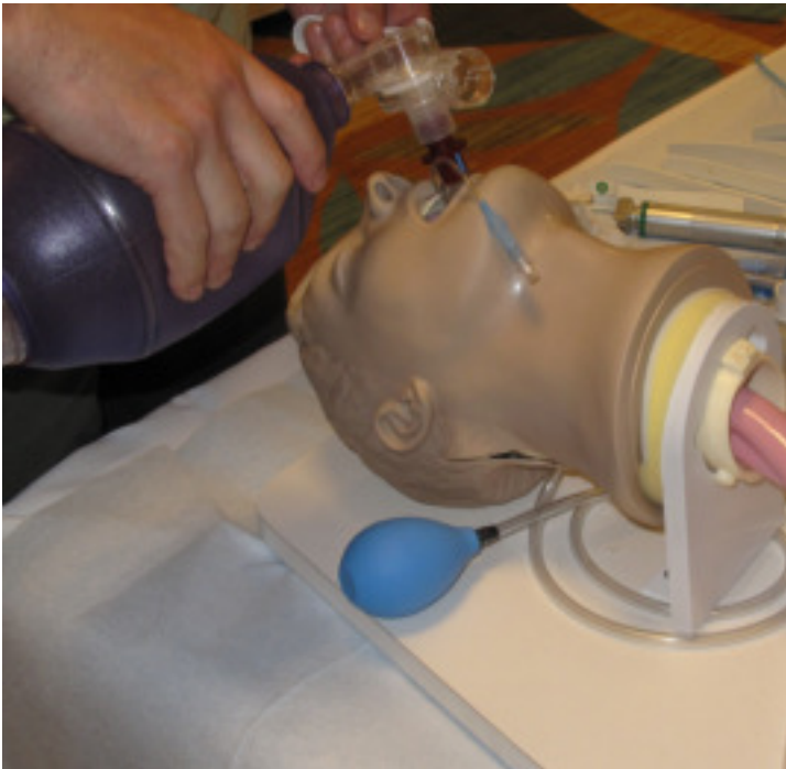
Step 3: Connect King tube to bag valve and attempt to ventilate