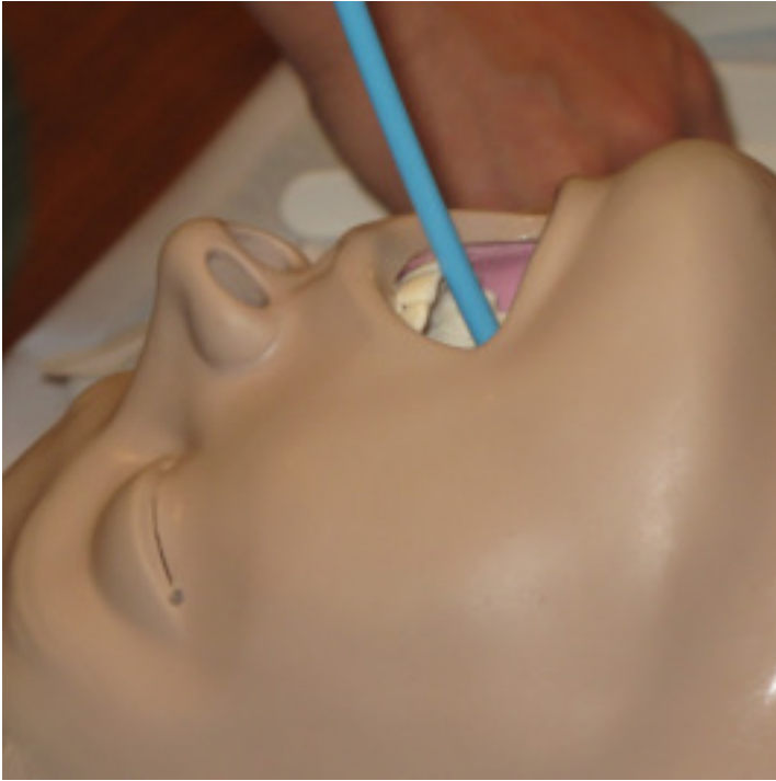
Step 5: Bougie remains in trachea while endotracheal tube is prepared