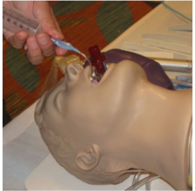
Step 2: Advance tube until red connector is at teeth and then inflate cuff using 60 mL syringe