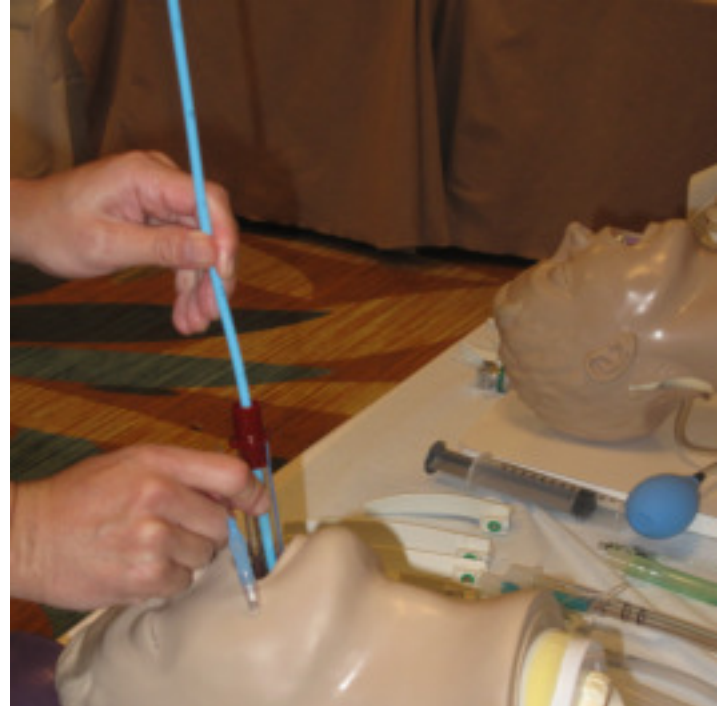
Step 2: Advance Bougie until felt to pass through distal tube into trachea