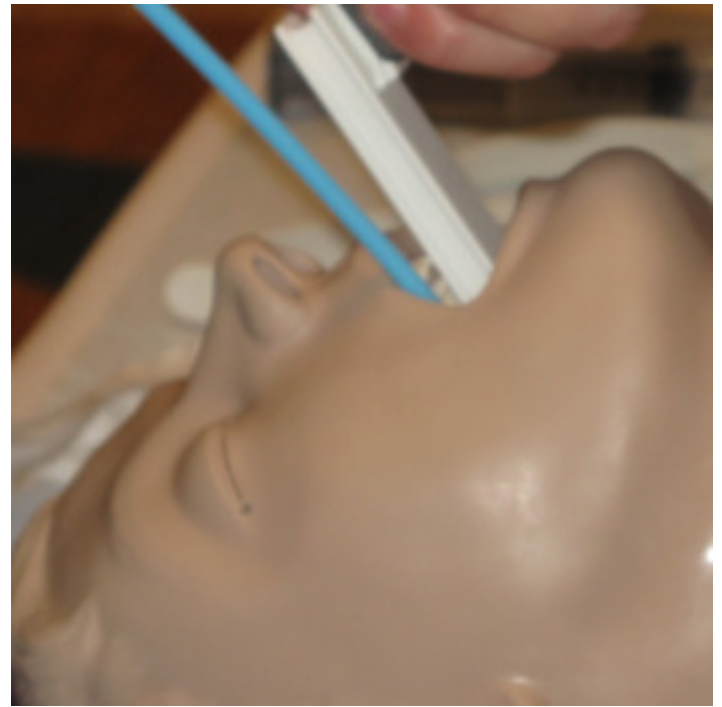
Step 6: Insert laryngoscope to facilitate passage of endotracheal tube