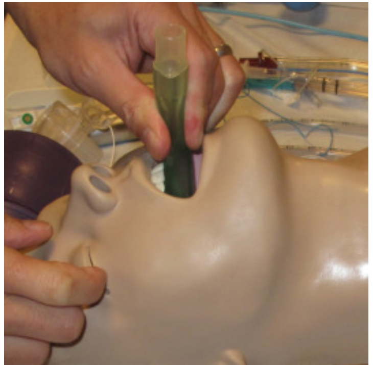
Step 4: Inflate LMA cuff, attach to bag valve and ventilate