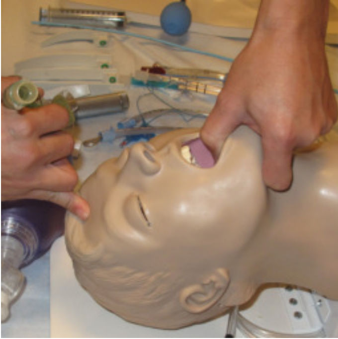
Step 1: Insert thumb into mouth and pull mandible down and forward to open mouth