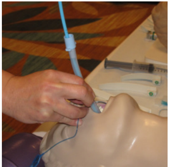
Step 8: Stabilize endotracheal tube and remove bougie