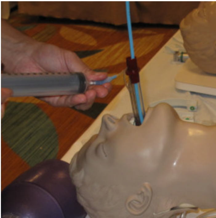
Step 3: Deflate King Tube cuff