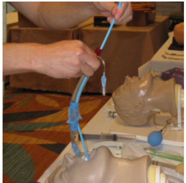
Step 4: Stabilize bougie and remove King Tube over bougie