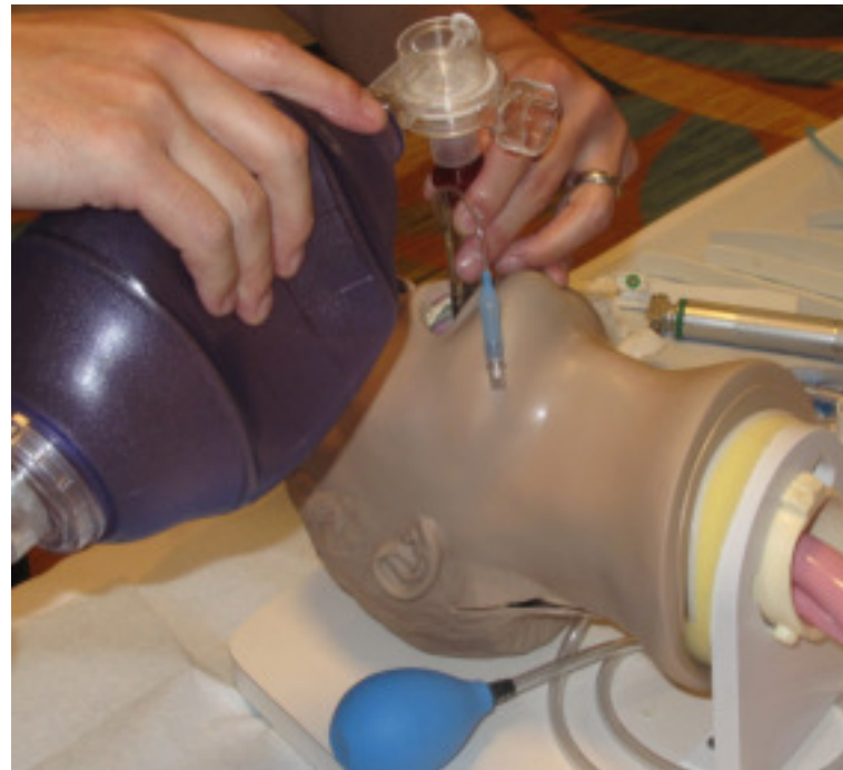
Step 4: Pull back King tube with cuff inflated until bag valve ventilation is optimal