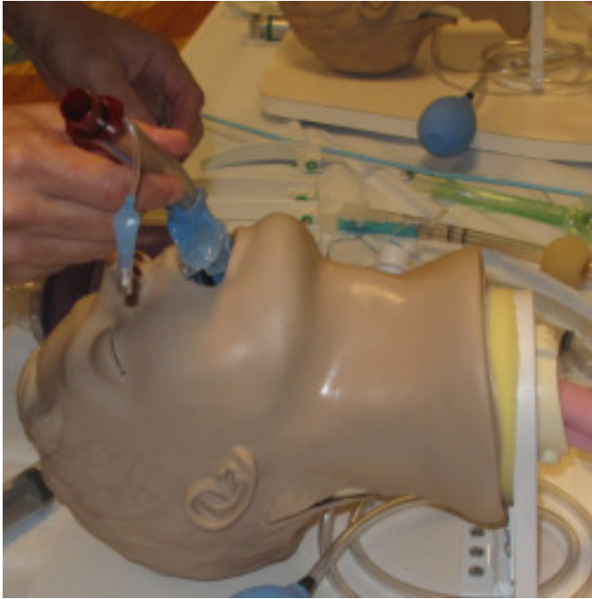
Step 1: Insert King Tube directed to right and turn anterior once tip passes base of tongue