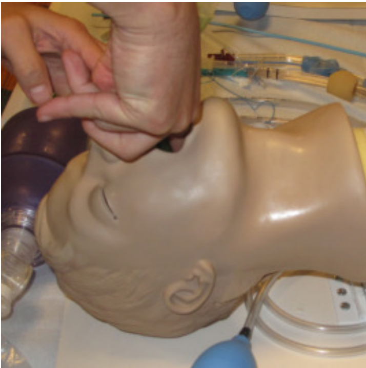
Step 3: Place index finger between mask and tube to guide LMA into place