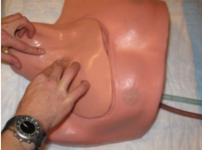
Step 1: Palpate landmarks: Anterior cervical triangle formed by clavicle and two heads of sternocleidomastoid muscle