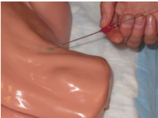
Step 5: Remove needle over guidewire