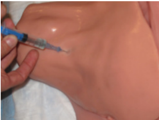
Step 3: Advance needle 2 to 3 cm until flash of blood from internal jugular vein seen in syringe