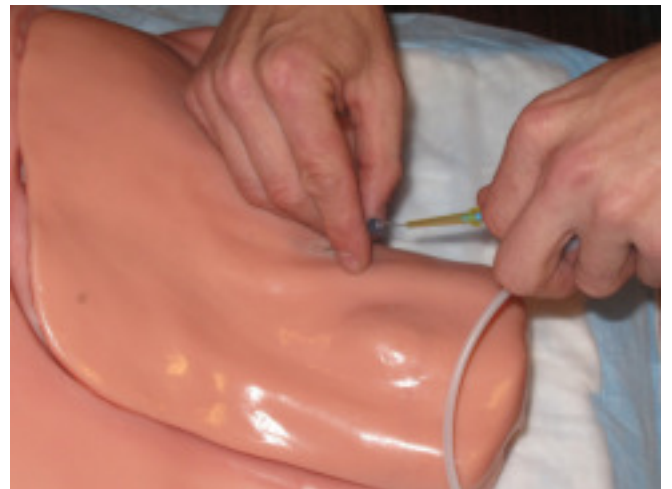
Step 4: Remove syringe, confirm nonpulsatile blood flow from needle, and advance guidewire through needle into vein