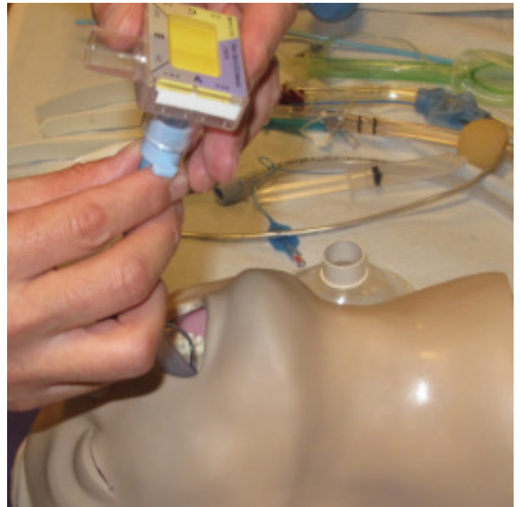
Step 4: Connect colorimetric CO2 indicator