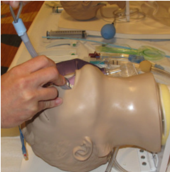
Step 3: Advance tube through vocal cords and remove laryngoscope