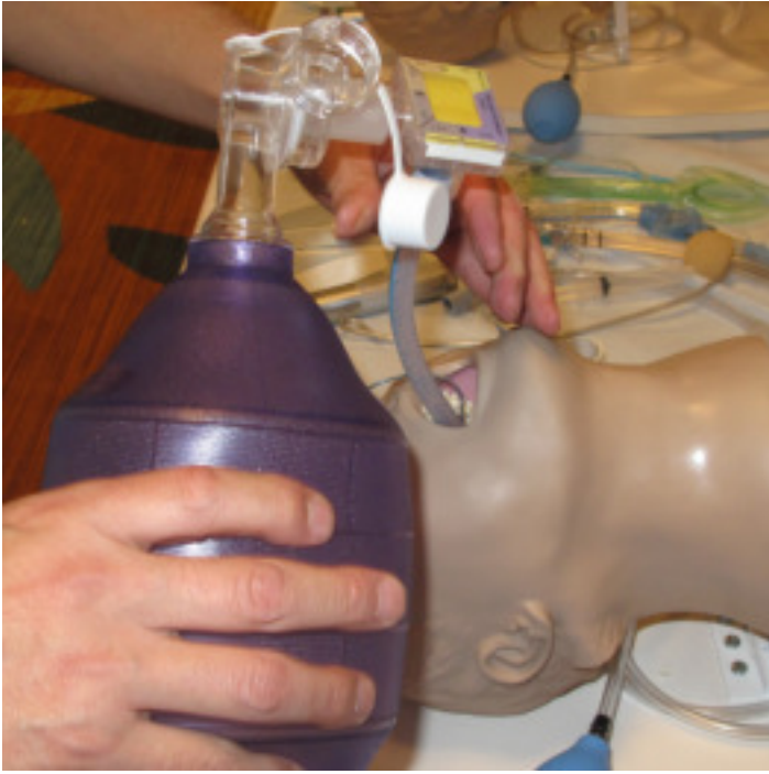
Step 5: Connect bag valve to CO2 indicator and ventilate to confirm purple to yellow color change