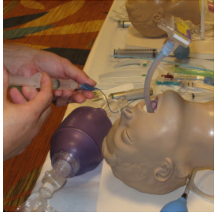
Step 6: Inflate endotracheal tube cuff with 10 ml syringe until pilot balloon full but soft