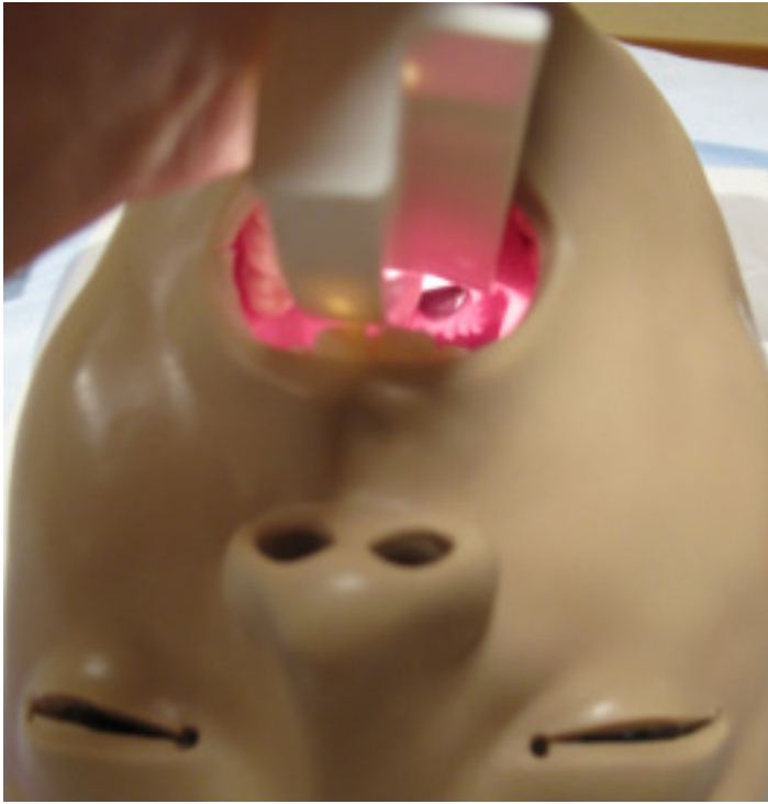
Step 1: Insert laryngoscope into vallecula and pull up along axis of handle to visualize cords