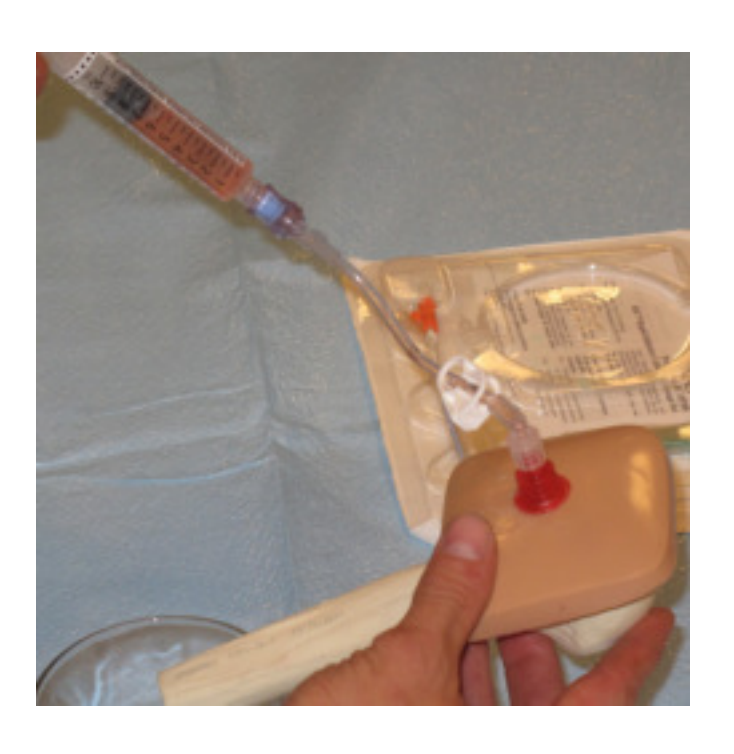
Step 6 : Aspirate bone marrow into tubing and confirm easy flush