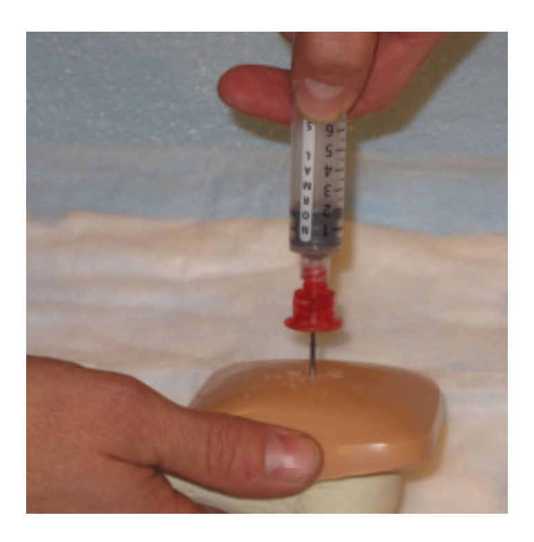
Step 7 : To remove gently pull while rotating catheter clockwise