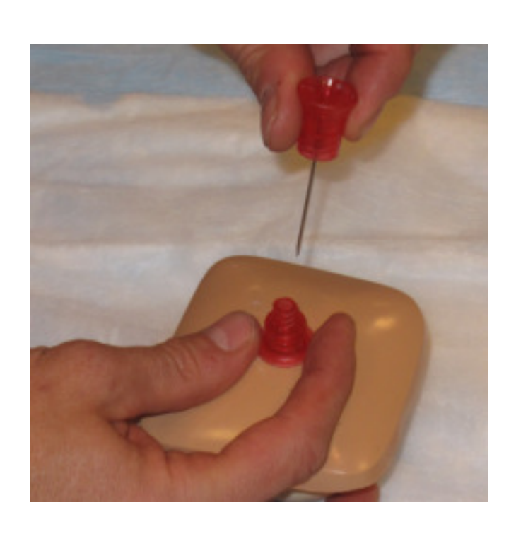
Step 4: Remove stylet from catheter