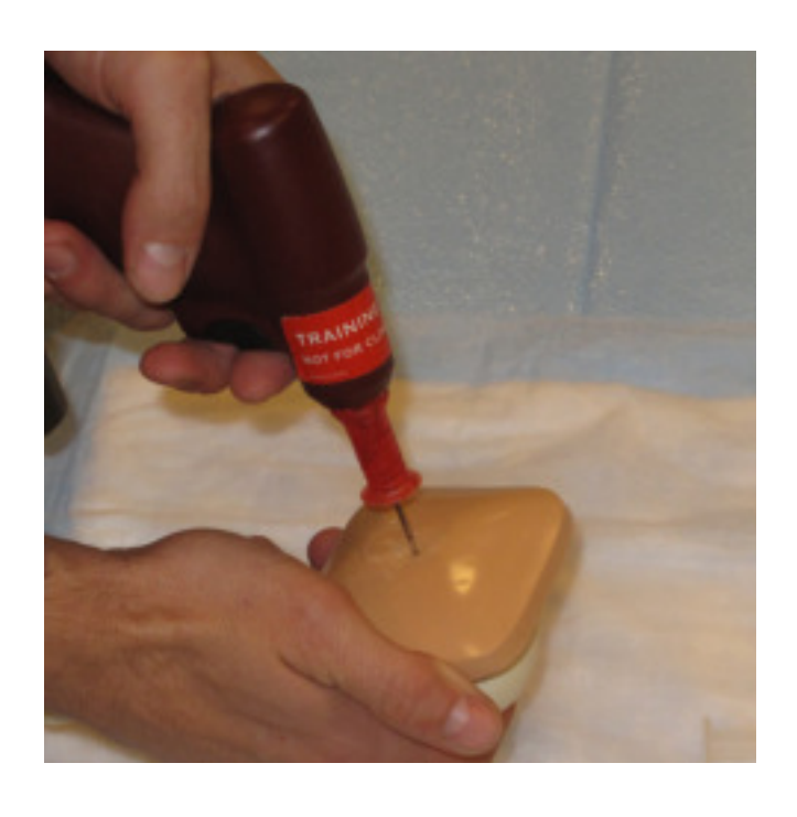
Step 2 : Puncture skin with EZ-IO needle at skin insertion site