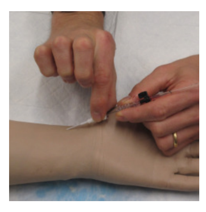
Step 5: Advance white catheter over guidewire into radial artery with a slow twisting motion