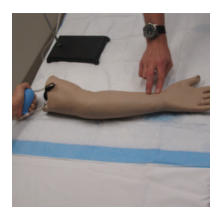
Step 1 : Palpate radial artery at two points along course to learn location and path of the artery. Assistant must pump blue bulb to simulate pulse