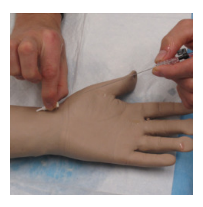
Step 6 : Remove guidewire, needle and clear plastic sheath together while stabilizing the radial artery catheter with other hand