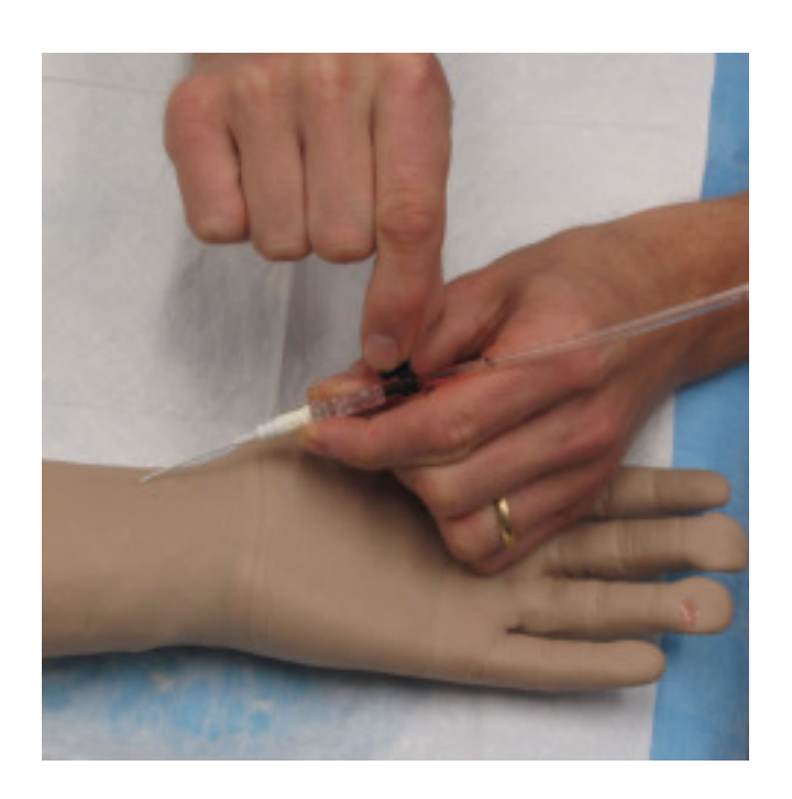
Step 4 : Advance black tab connected to guidewire until tab is flush with distal end of plastic sheath