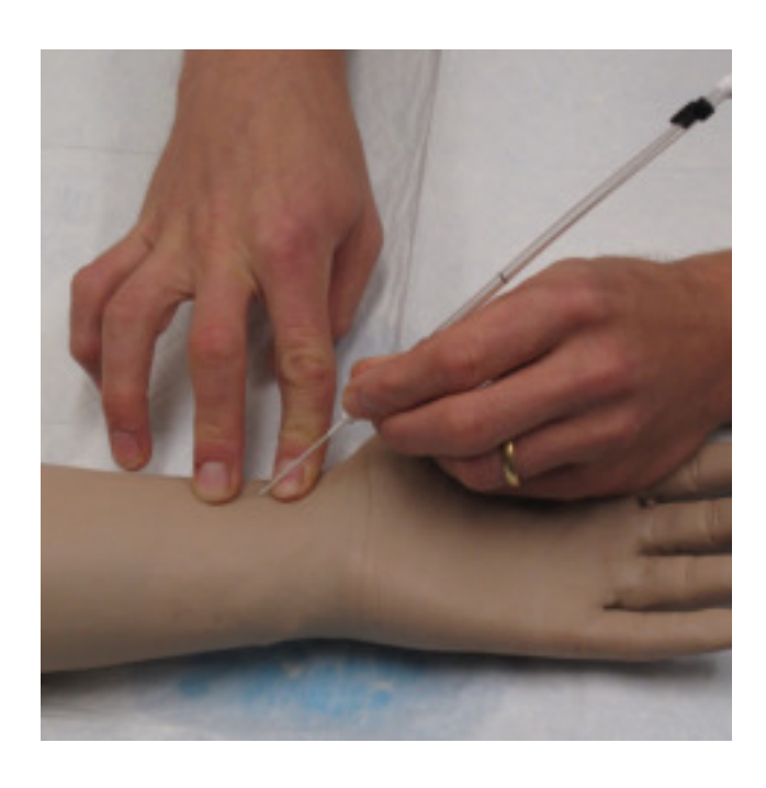
Step 2 : Using arterial line catheter, puncture skin just proximal to distal wrist crease along course of radial artery